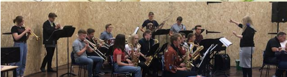
Our band played at the Friends of Burton Borough fundraising event. It was a brilliant evening where everyone tucked into fish and chips and participated in a quiz!