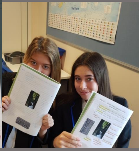
Here are some of our students showing pieces of work they completed in Geography lessons. Look how proud they look!

Some examples of live marking and extended writing.