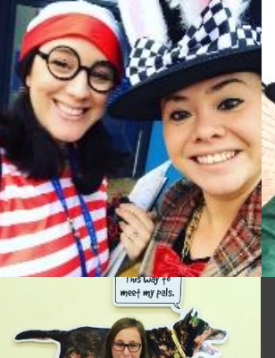
This amazing young lady did charity work to raise money for Dogs Trust. Look at all that dog food she was able to buy!